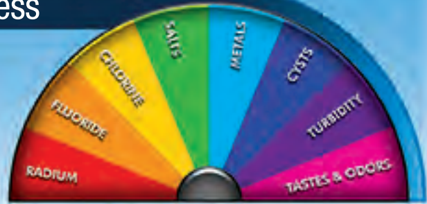
Reverse osmosis systems remove the entire spectrum of harmful contaminants.

Reverse Osmosis (RO) drinking water systems include mechanical filtration to remove particles, carbon absorption and absorption to remove chlorine, taste, odor and chemical contaminants, as well as membrane separation down to .0001 microns. RO membranes remove dissolved solids at the ionic level. No other purification system can provide better removal. Reverse Osmosis Systems provide the best quality drinking water for your family.